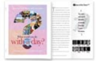
Staple and Engineering Z-Fold

Our copier/printer lets you do more. You'll have the capabilities you need to create an array of in-demand applications today – and to develop innovative and business-generating applications in the future. Here are some examples of the types of applications you can easily create and the businesses you can serve with our copier/printer.