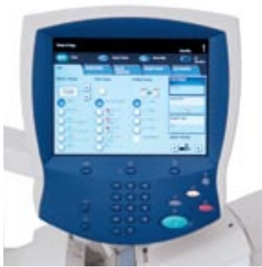
Integrated Copy/Print Server