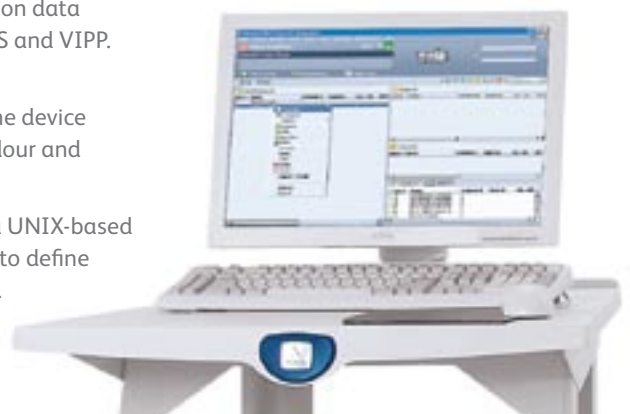
FreeFlow Print Server