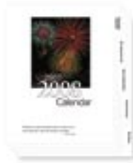
Tabs and Colour Inserts