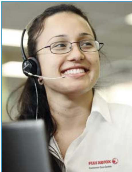
Access to our Customer Care Centre is available around-the-clock.

The Technical Support Centre resolves over 90% of technical issues on the spot. The team consists of highly skilled industry certified IT professionals, with access to state of the art laboratory facilities where they can replicate and solve a wide range of issues related to industry standard networks and applications over the phone.