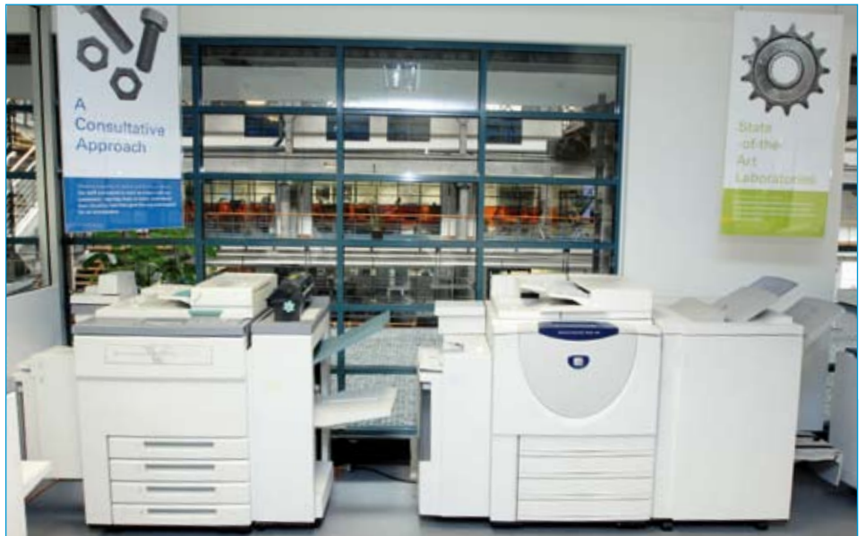
The Technical Support Centre's extensive laboratory facilities.