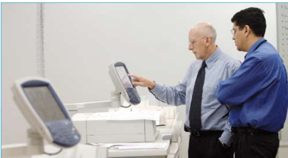
A Customer Education demonstration conducted by a Fuji Xerox representative.

For further information or to order consumables via our Valets program, please contact the Customer Care Centre on 1800 028 962 .